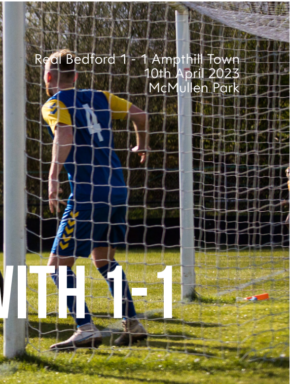
Real Bedford 1 - 1 Ampt Hill Town 10th April 2023 McMullen Park